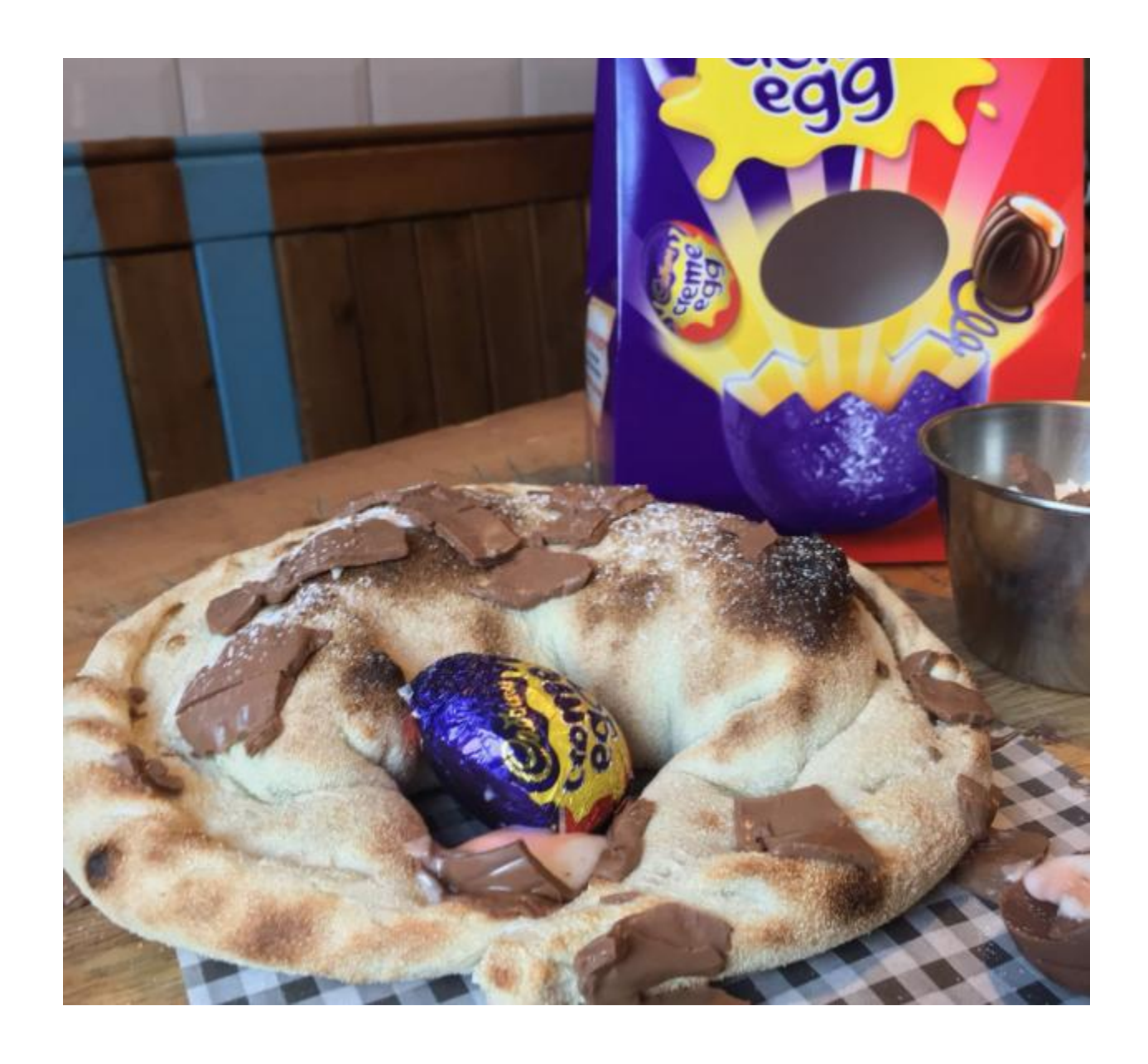
Take a look at Civerinos' Easter calzone